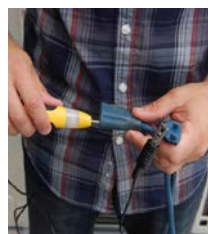
Competent person testing extension cord.

Cords and tools with exposed, frayed, or spliced wiring, a missing prong, or cracked casings should be removed and tagged as "Do Not Use." Use double insulated tools marked with the symbol below.