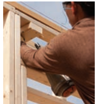
Nail penetration through the lumber is a special concern where the piece is held in place by hand