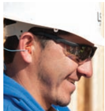
Worker using recommended PPE when working with nail guns: hard hat, safety glasses, and hearing protection