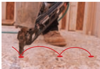
Bump firing or bounce nailing is using a nail gun with a contact trigger held squeezed and bumping or bouncing the tool along the work piece to fire nails. Red dots show path of motion.