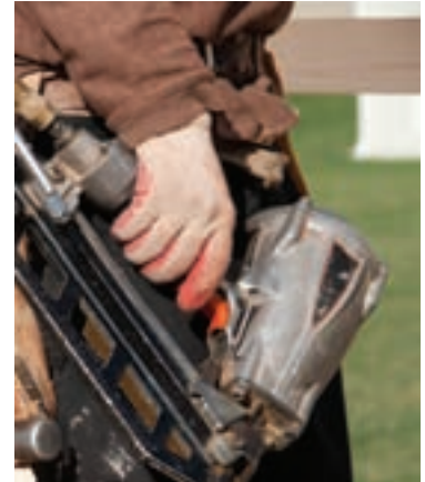
Common nail gun grip with finger on trigger

Bypassing or disabling certain features of either the trigger or safety contact tip is an important risk of injury. For example, removing the spring from the safety contact tip makes an unintended discharge even more likely. Modifying tools can lead to safety problems for anyone who uses the nail gun. Nail gun manufacturers strongly recommend against bypassing safety features, and voluntary standards prohibit modifications or tampering. 7 OSHA's Construction standard at 29 CFR 1926.300(a) requires that all hand and power tools and similar equipment, whether furnished by the employer or the employee shall be maintained in a safe condition.