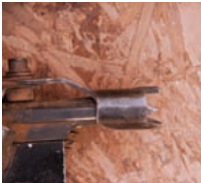
Contact safety tip